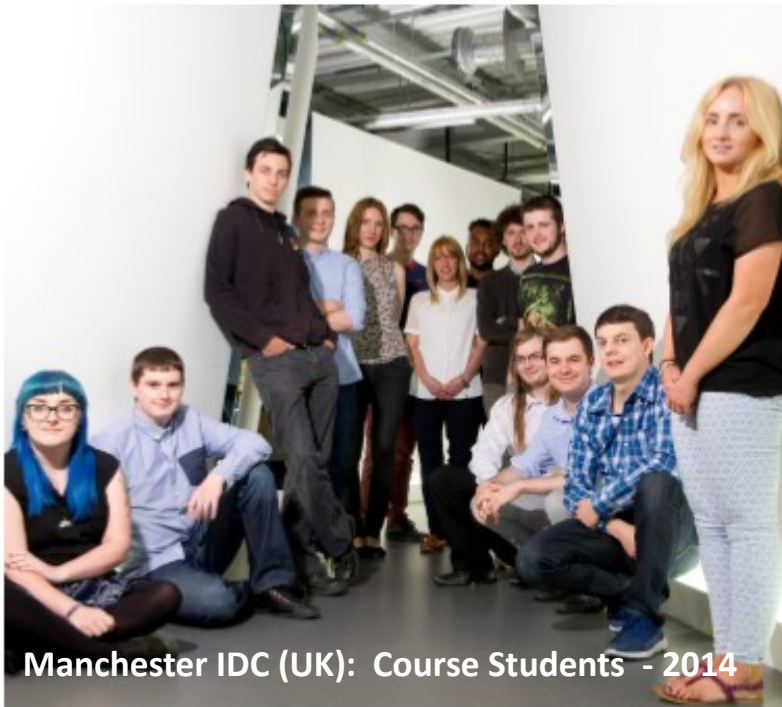
Manchester IDC (UK): Course Students - 2014